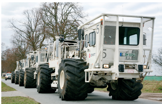
Fig. 3: Seismic vibrators working in the northern part of Denmark

The CO 2 will be stored in a saline aquifer, more specifically within the onshore Vedsted geological structure, which comprises an anticlinal closure within a large fault block. The cap rock includes several thick clay stone intervals above the reservoir, and also a thick chalk section close to the surface constituting a secondary seal. The target storage reservoirs consist of Triassic to Jurassic sandstones with good porosities and permeabilities. The expected storage capacity is approximately 100 million tons or more.