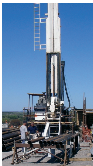
Fig. 4: Core drilling in the Sulcis basin

Moreover, as end-user of the European project MOVECBM, Carbosulcis has recently started a project entitled " Coal-bed methane and enhanced coal-bed methane (CBM/ECBM) recovery and CO 2 geological storage performance assessment at the Sulcis Basin " in collaboration with BRGM, IFP, Imperial College, OGS,