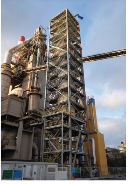
Figure 2: LEILAC1 Pilot Plant

The follow-on project – LEILAC2, following the success of the previous H2020 LEILAC1 project, will build a Demonstration Plant that will capture 20% of a full-scale cement plant's (and 100% of a large lime kiln's) process emission – capturing around 100 ktpa of CO<sub>2</sub> for