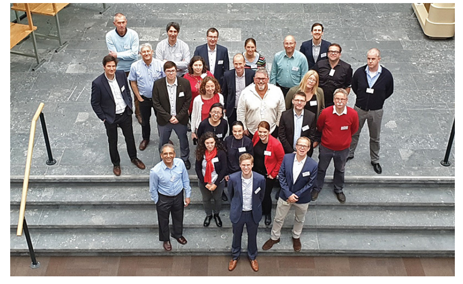
Figure 4. The REX-CO<sub>2</sub> project team together with representatives from ERA-ACT at the kick-off meeting at the TNO office in Utrecht in October 2019