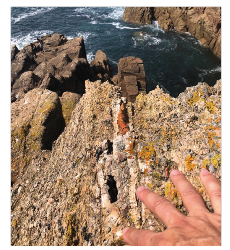
Figure 6. Fractured granite in a Cornwall outcrop analogue for the United Downs Deep Geothermal Power Project (www.uniteddownsgeothermal.co.uk/).