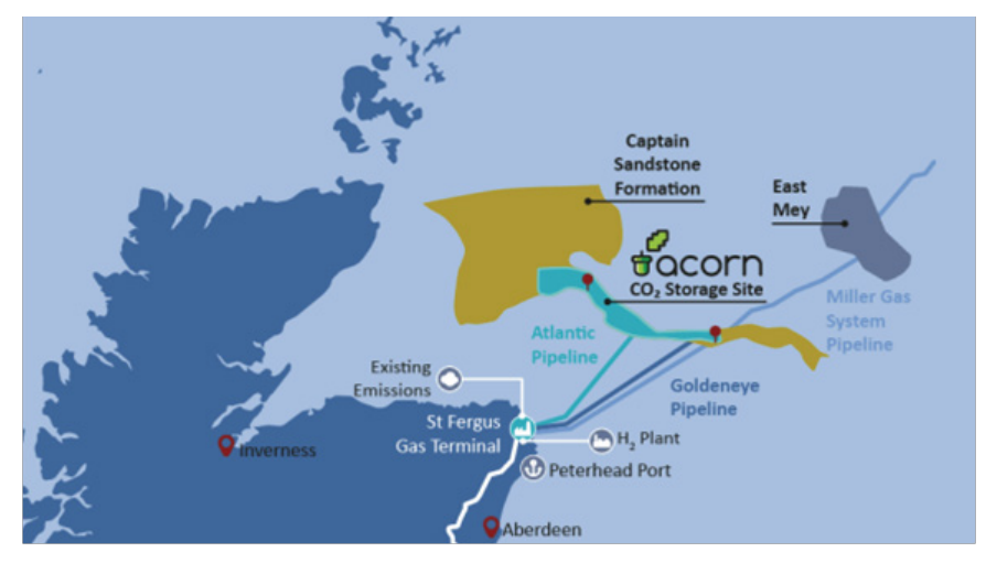
Figure 5. The ACORN Project (https://pale-blu.com/2018/11/27/acorn-ccs-award-ed-co2-storage-site-lease-option-from-crown-estate-scotland/).

GEUS - Geological Survey of Denmark and Greenland (Denmark) Dr. Niels E. Poulsen nep@geus.dk